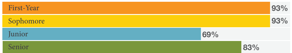
Class Year Breakdown